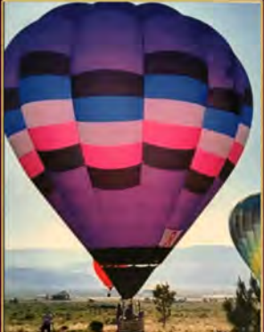
Debi Ostqulen (Plum Fired-Up) Albuquerque, NM Nucor Inc