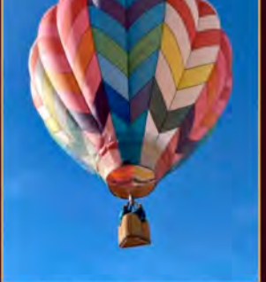
Pat Newlin (Some Day Come) Riverton , WY Java Java Espresso