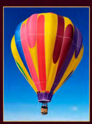
Ginny Rieger (Hot N' Bothered) Sheridan, WY All-Star Auto Glass