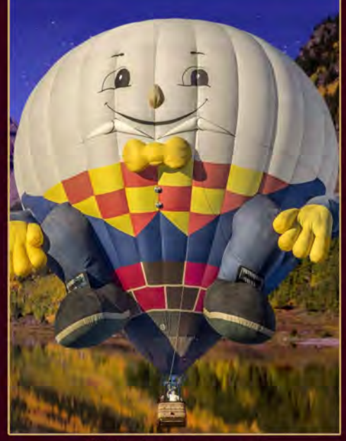
Rich Lawhorn (Humpty Dumpty) Louisville, KY Casper Children's Center